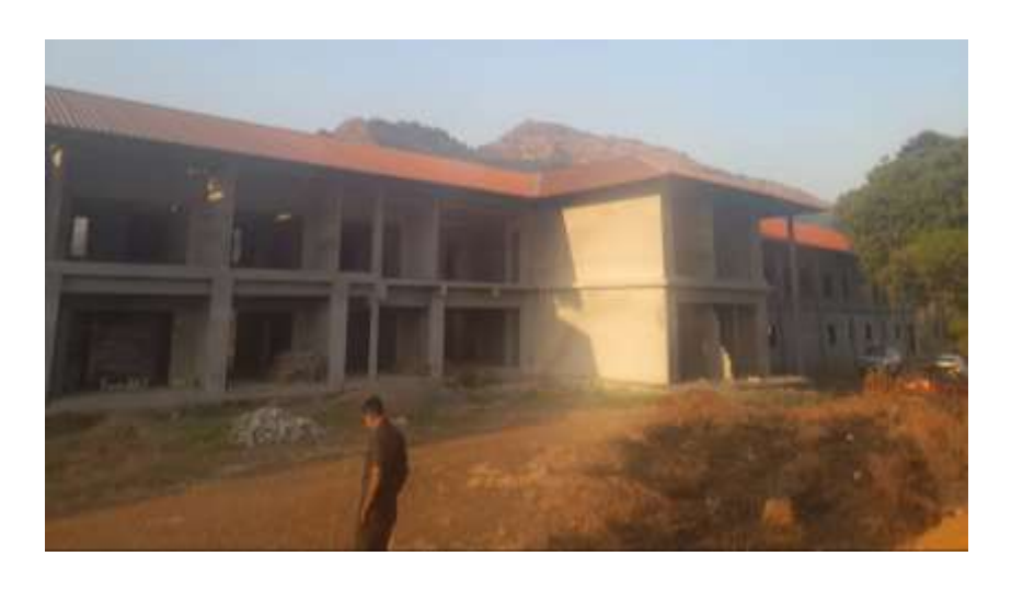
SBGI, Mulshi Resort