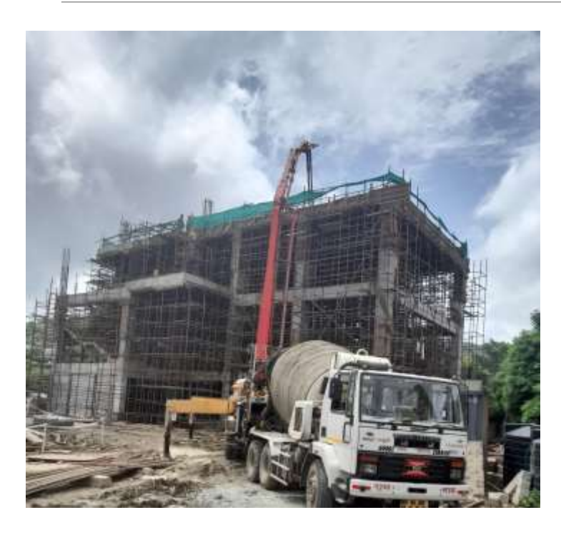
RSS 2 Tata projects Hinjewadi